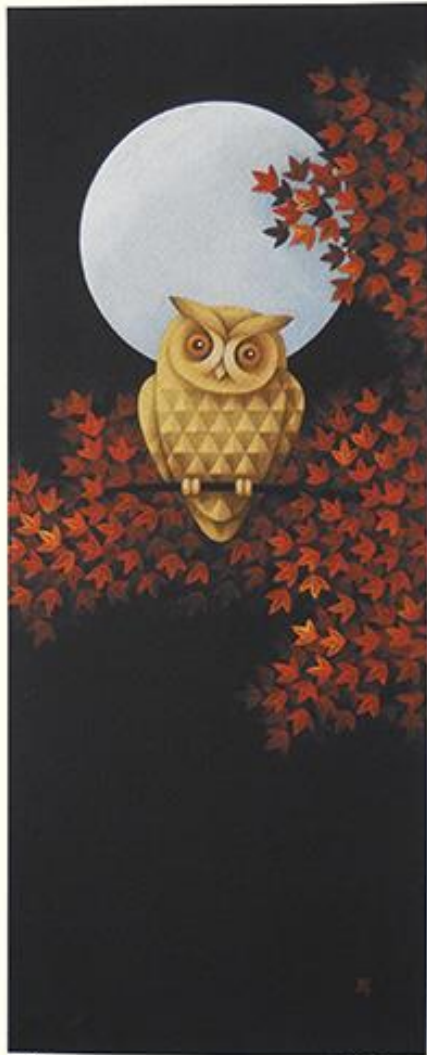
9 Scops owl ( Otus sp.) by Masasuke Chiba , screenprint entitled autumn, 300 x 600 mm