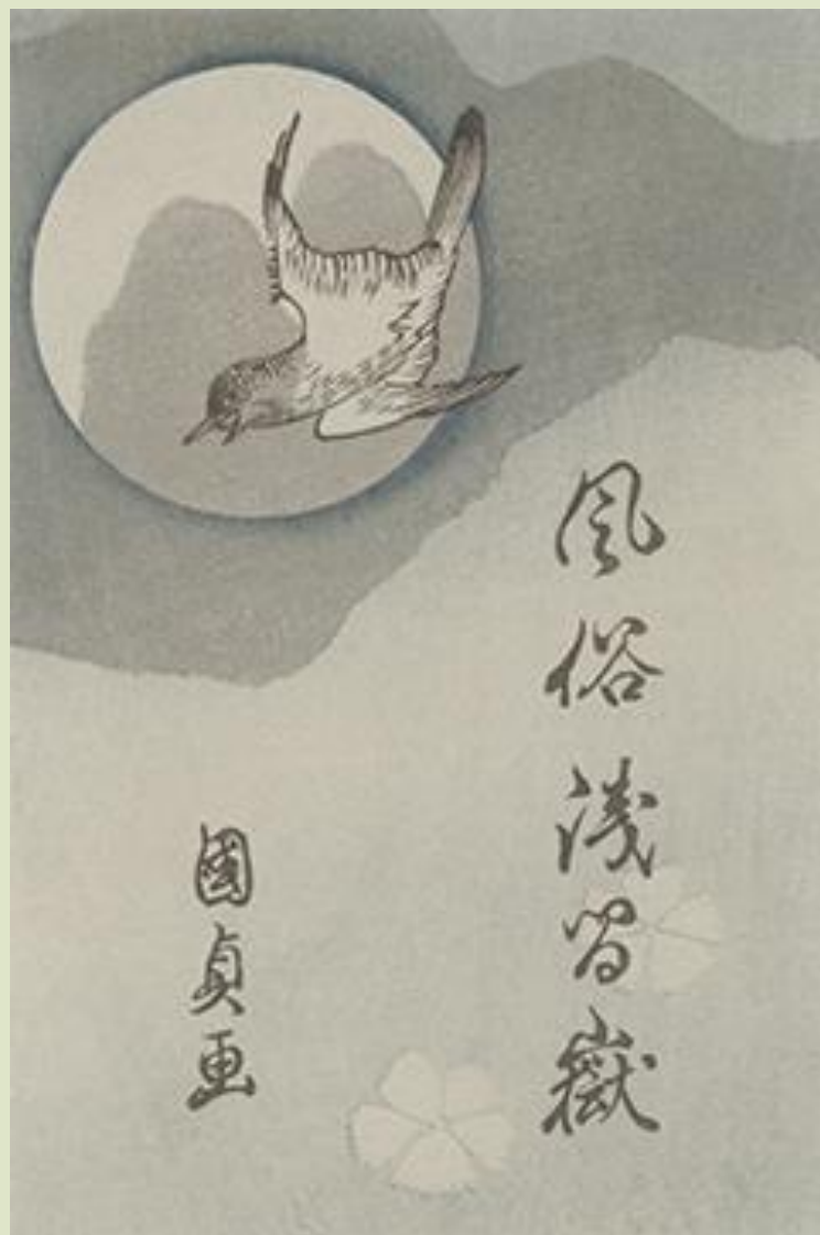
27 Lesser cuckoo ( Cuculus poliocephalus ) by Kunisada Utagawa , woodblock print, 105 x 155 mm