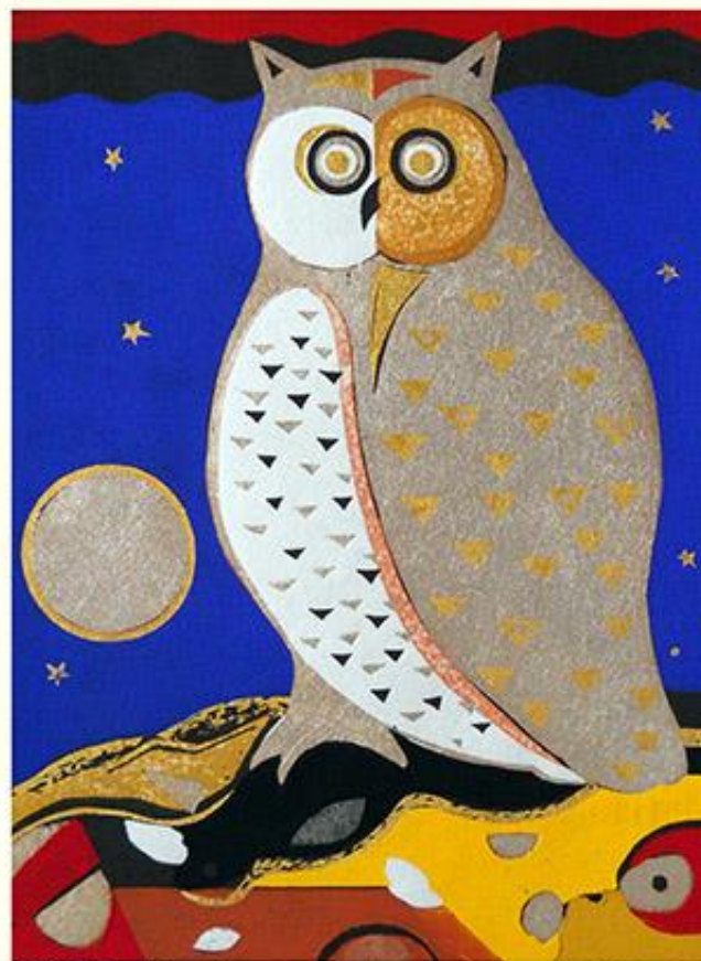
12 Scops owl ( Otus sp.) by Yoshiharu Kimura , woodblock print entitled morning stars, 1991, 305 x 375 mm