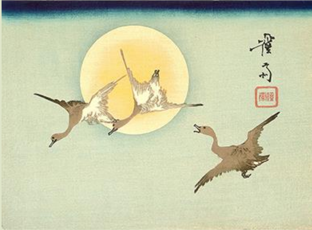
23 White-fronted goose ( Anser albifrons ) by Eisen Ikeda , woodblock print, 260 x 190 mm