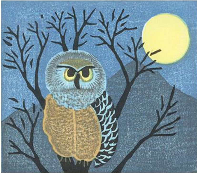
5 Ural owl ( Strix uralensis ) by Kōzō Onishi , woodblock print, 125 x 110 mm