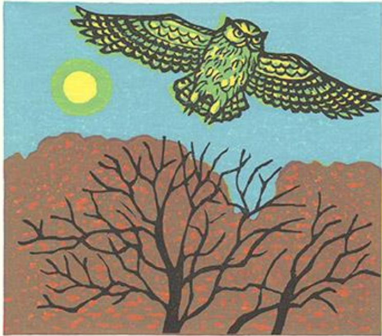
7 Scops owl ( Otus sp.) by Kōhō Ōuchi , woodblock print, 145 x 125 mm