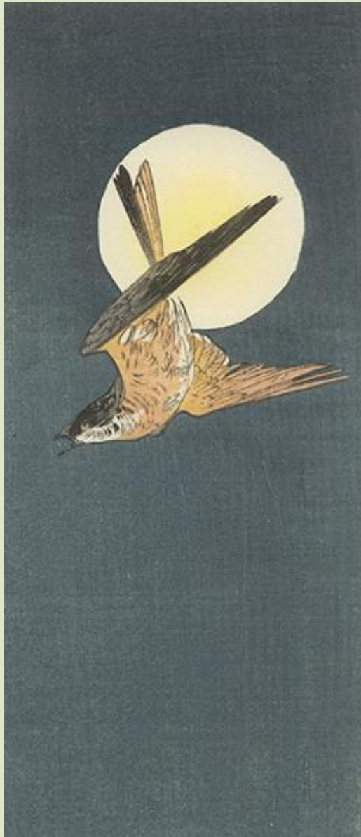
25 Lesser cuckoo ( Cuculus poliocephalus ) by Shōun Yamamoto , woodblock print, 90 x 210 mm