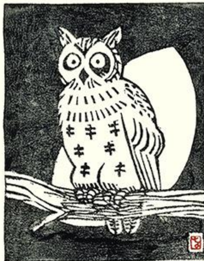
2 Scops owl ( Otus sp.) by Shinji Nagashima , 1996, woodblock print, 115 x 150 mm