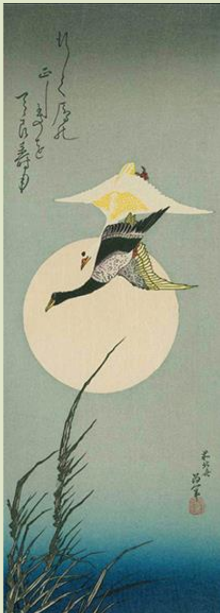
15 Goose ( Anser sp.) by Hokusai Katsushika , woodblock print, 175 x 385 mm