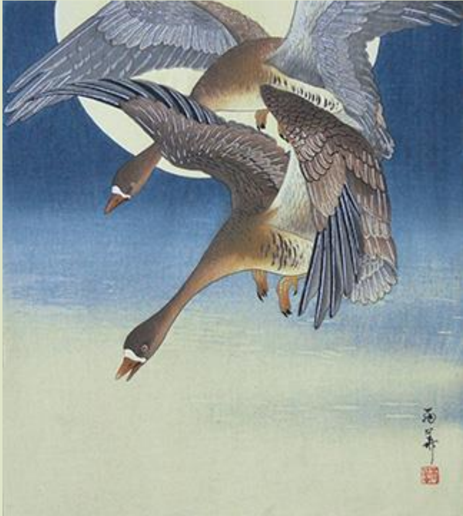
13 White-fronted goose ( Anser albifrons ) by Ryōmi , woodblock print, 240 x 270 mm