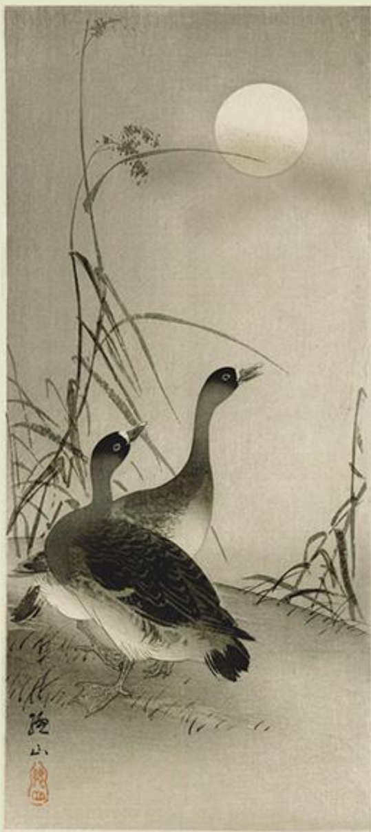
19 White-fronted goose ( Anser albifrons ) by Sōzan Itō , woodblock print, 175 x 380 mm